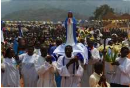
Our Lady of Kibeho

But would it really bear fruit? After only a year and a few Months, hell would be unleashed on Rwanda, a Genocide of Unimaginable Proportions, with frightening Massacres causing Hundreds of Thousands of Deaths, as the Virgin Mary announced during her appearance in Kibeho, a Small Town in Rwanda.