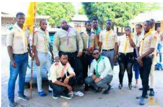
Catholic Youth Associations