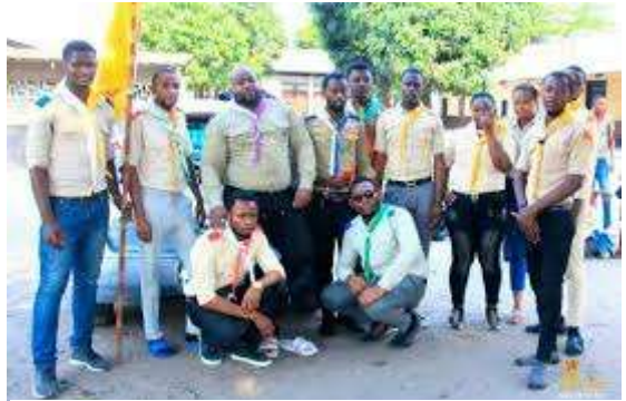
Catholic Youth Associations