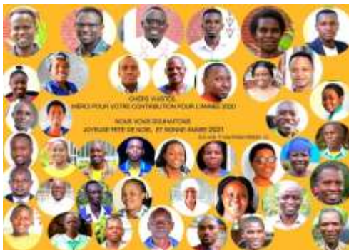
New Youth Vision

of Respect, Fraternity, of Development, according to the “dream” of Brother Cardinal. We could glimpse these seeds of hope in the pacification of the Country, in the New Economic Development, in youth Organizations