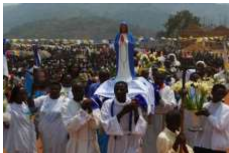
Our Lady of Kibeho

But would it really bear fruit? After only a year and a few Months, hell would be unleashed on Rwanda, a Genocide of Unimaginable Proportions, with frightening Massacres causing Hundreds of Thousands of Deaths, as the Virgin Mary announced during her appearance in Kibeho, a Small Town in Rwanda.