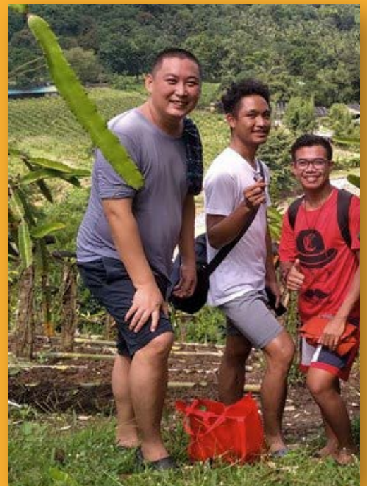
During an outing in the mountains not far from Manila.