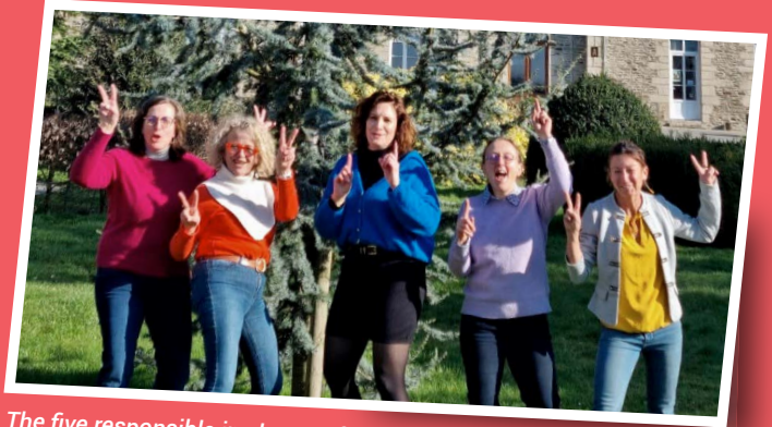
The five responsible in charge of the education and reception centers of Estival : Palandrin, Créac'h Balbé, the villages of Sources d'Armorique and Derval and the Escales de Nantes and Landerneau.

The "Peeps La Mennais" Association – formerly "Faith and Prayer" – has also just announced its merger within Estival. Another occasion for celebration: the opening of the new reception center in Créac'h Balbé, Finistère, France : www.creachbalbe.fr