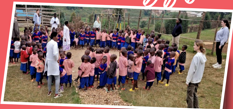
An unforgettable trip to Rwanda for the 14 young people of the St. François d'Assise High School in Savenay, France.