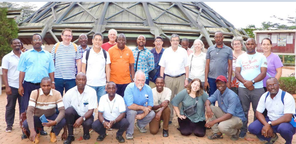
The participants-formators during the visit of the Shrine of the Martyrs of Uganda.

Last February, a 5-day meeting was held in Kisubi, Uganda, where 25 Brothers and Laity took part. This formation will continue online, until July 2025, when a new formation will take place in Ploërmel.