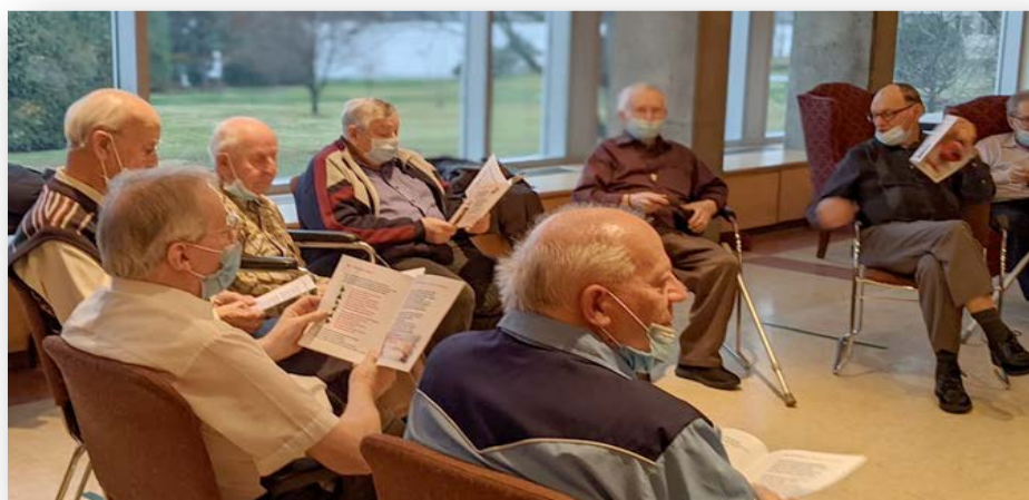
The Brothers have been living in the residence for one year.