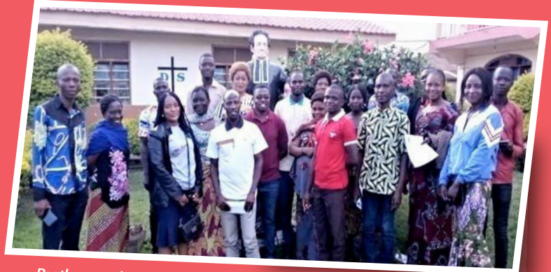
Brothers and Laity of Bunia, DRC, on Founder's Day, last November.

The Mennaisian family from Bunia, Democratic Republic of Congo, regularly assembles for meetings.