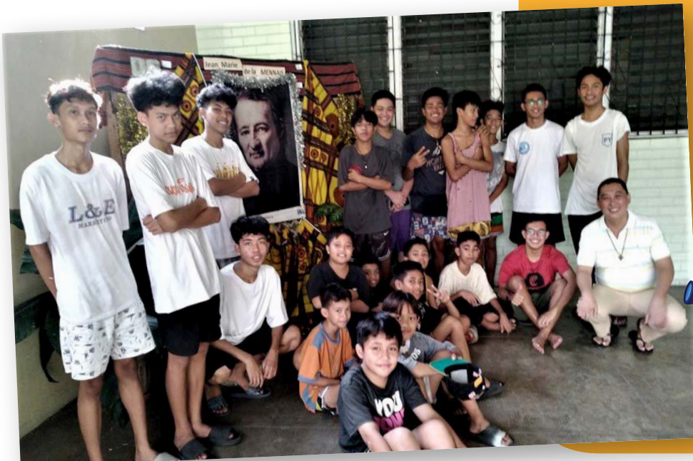
With the young people of the neighborhood who come to play basketball at the Brothers' residence in Manila. A brief celebration, followed by a friendship drink on Father's Day last November.