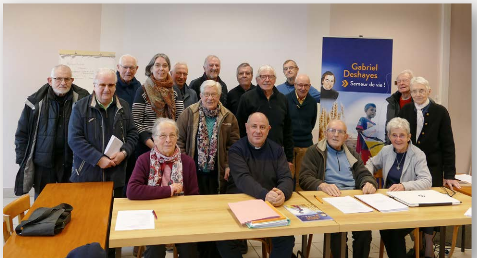
The leaders of the Daughters of Wisdom, the Brothers of St. Gabriel, the Sisters of Christian Instruction of St. Gildas, the Brothers of Christian Instruction – La Mennais, Ploërmel and the Montfortian Missionaries – Fathers and Brothers of the Company of Mary with members of the association of Friends Deshayes, during the assembly at the Mother House of Ploërmel.