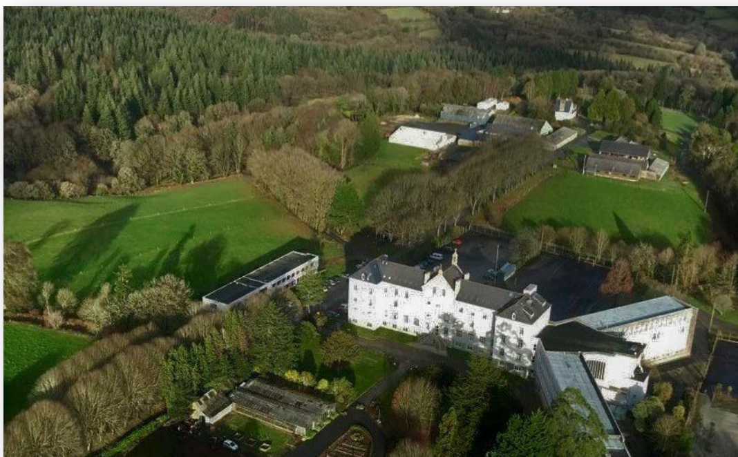
An establishment nestled in the heart of 350 hectares of a remarkable forest.