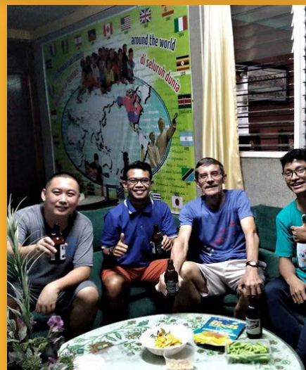
Our traditional Friday "Happy Hour" party at the Scholasticate in Manila, Philippines.