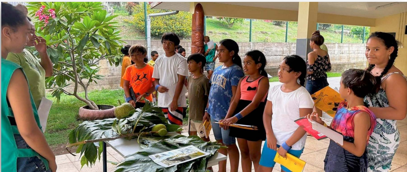
Pride of the young people of St. Athanase's High School, Te Henua Enana, formerly CED St. Joseph.

The 3rd year students led multiple workshops with primary schools in the Marquesas in recent weeks.