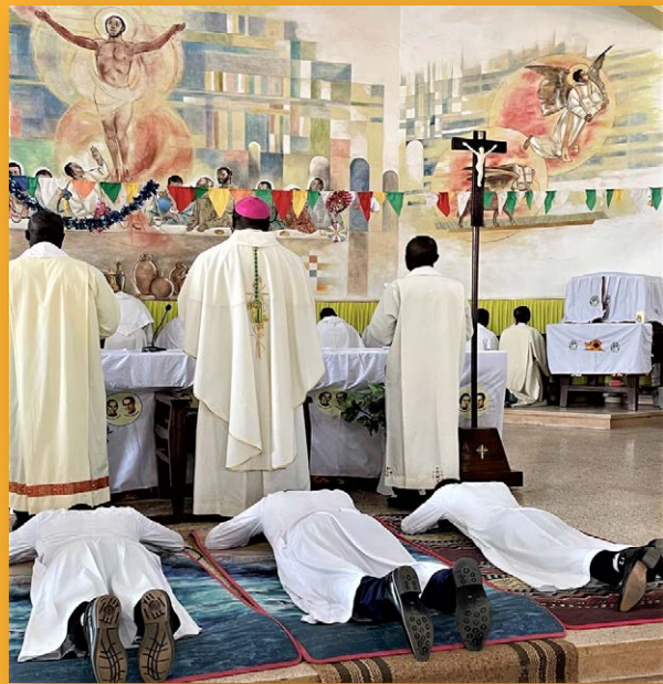
Perpetual vows of three Brothers in Rwanda, last January. Here, the Brothers during the Litany of Saints.

«The Brother is the witness of Christ through his way of life. He shares fraternal life and mission. His teaching must be consistent with the Word of Christ, in his daily life.»