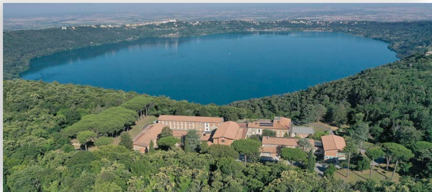
The Chapter will take place in Ariccia, at the Casa Maestro Reception House, run by the Pauline Spiritual Family.

The next General Chapter – an elected assembly of Brothers responsible for defining the orientations of the next 6 years – has now been announced. It will be held in Ariccia , on the heights of Castel Gandolfo, Italy – not far away from Rome – from March 26 to April 24, 2024 .