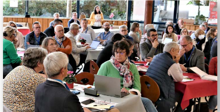
The La Mennais Education France Network is composed of 35,393 children and young people, and 3,600 staff, the second congregational network. Here at the annual directors' meeting.