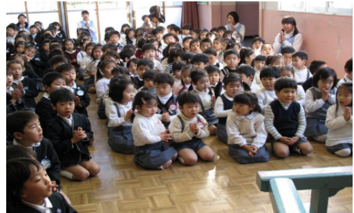
Kindergarten in Yokohama

A highly regarded Japanese school that focuses on excellence. On the same property, there is also a kindergarten, "Sayuri Kindergarten", which is also very popular among local families.