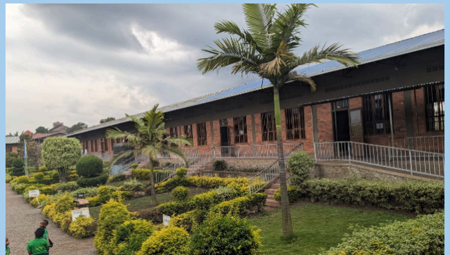
First school building. The project involves adding a floor.

On February 2, 2016, the school opened its doors with 7 students and by the end of the year, it had 17 students, two teachers, and a Brother serving as a headmaster. In 2017, we had 3 kindergarten classes and 2 primary classes (one for first grade and another for second grade), with a total of 205 students and 6 teachers. In 2018, the school welcomed 365 students, from kindergarten through fifth grade. Since then, it has continued to thrive in the region and has become renowned and nationally recognized center. The top 17 candidates for the national secondary school leaving exams (PLE) are currently in seventh grade and will sit for these exams next year. All former sixth-grade students who have moved on to middle school are performing well, with no cases of repetition.