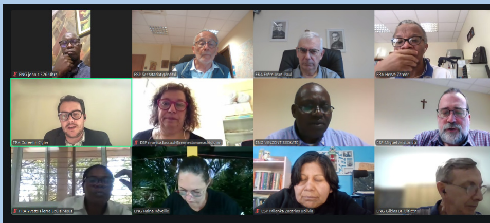
The 12 members of the ICMF across 5 continents

The commission is composed of six Brothers from the General Government of the Institute and six lay people from diverse backgrounds. It has recently been renewed and was able to meet online on May 21st. This first meeting, facilitated by the three-member International Bureau, provided an opportunity to review the current state of the Mennaisian Family and to plan for future initiatives in accordance with the orientations adopted by the 2024 General Chapter.