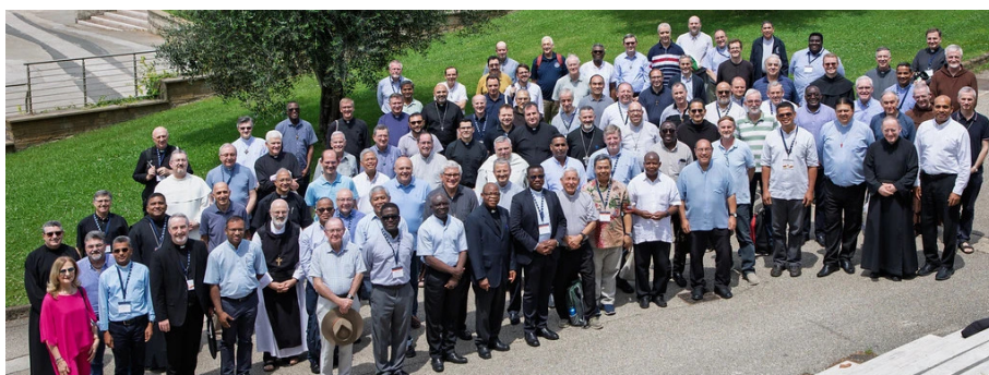
The General Superiors during the meeting