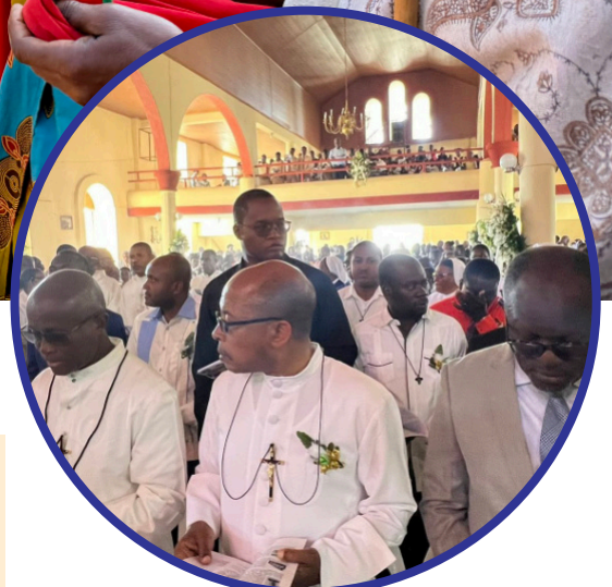
Closing Eucharist of the Centenary of the Mennaisian Presence in La Vallée – Haiti