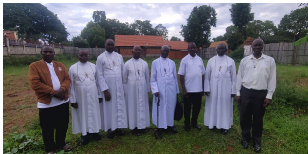
On the Land where the future home for the elderly Brothers will be built