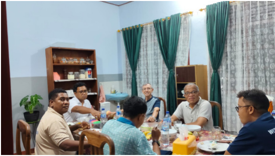
The Larantuka community welcomes its visitors