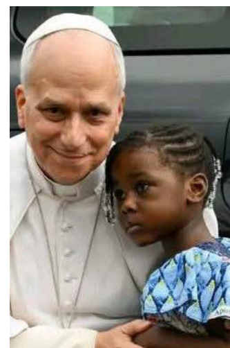
Pope Leo XIV, in Bamenda, Cameroon, on April 16, 2026

Humanity, created by God in all its grandeur, is today facing a pivotal choice: either to construct a new Tower of Babel or to build the city in