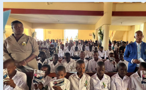
Children present at the festive Eucharist on May 17th

Although the centenary celebrations have ended, the mission continues, carried by the legacy of yesterday's builders and the hope of tomorrow's generations.