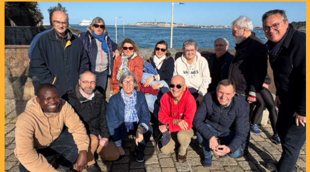
The participants in Dinard, with Saint-Malo on the horizon

In February 2026, about fifteen lay people and Brothers from Guérande met in Dinard for a two-day spiritual break.