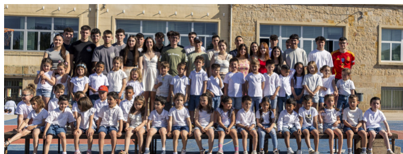
Students participating in the activities

The Mennaisian school of Saint-Grégoire takes its name to Pope Saint Gregory VII, whose feast day is celebrated on May 25.