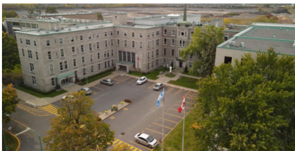
Jean de la Mennais School - La Prairie

Jean de la Mennais College, in La Prairie, and Notre-Dame du Saint-Laurent Juniorate, in Saint-Romuald, Lévis