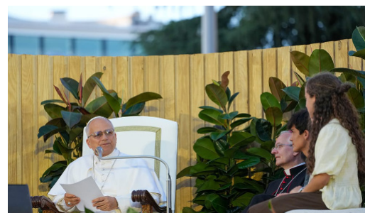
Vigil of Pope Leo XIV with young people

Based on this theme, the Pope invited Spain to return to the source of the Gospel. He called, he called on political leaders to overcome political polarization through dialogue and to build civic friendship that fosters a "culture of encounter". He also emphasized the importance of addressing the migration crisis in a humanitarian and dignified manner. He urged young people to become the "spark" of a new humanity in the face of indifference.