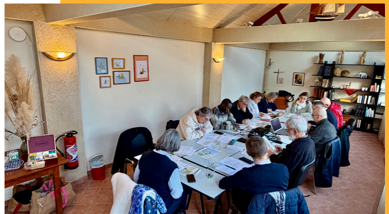
Exchanges at the Maison Saint-François in Dinard