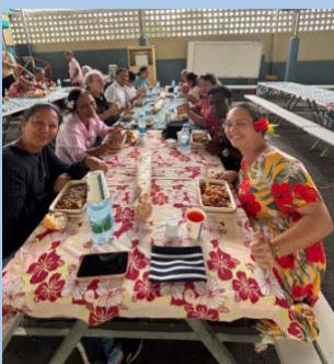
Shared meal at the end of the retreat