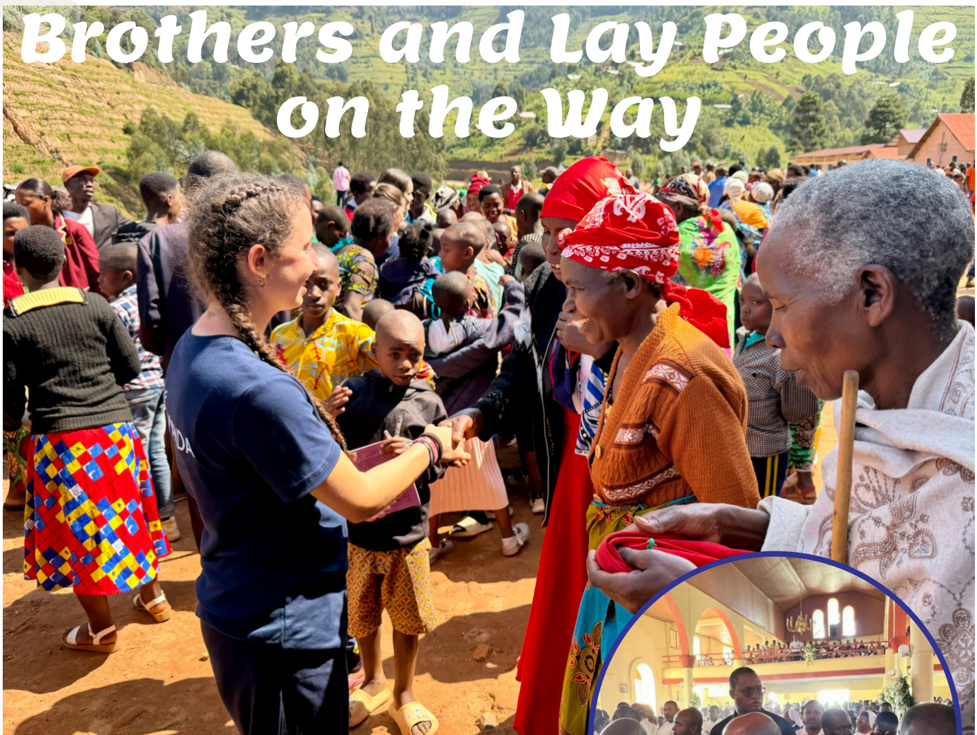
French Youth Stay in Rwanda. Mennaisian Educational Partnership