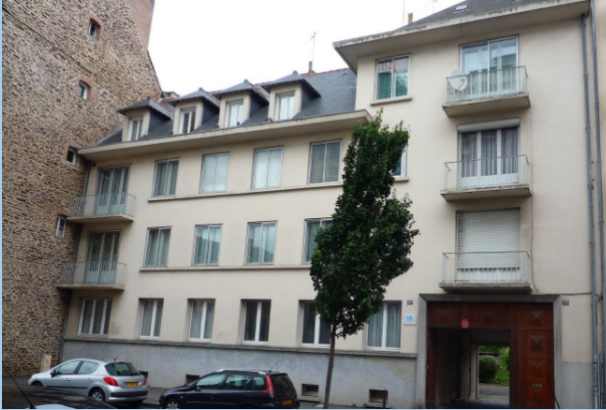
The house and the entrance porch, St-Hélier Street side

The minutes of the 2024 General Chapter state: "The Chapter therefore decides to transfer the General House to Rennes (France) to a house that already belongs to the Congregation and that meets the needs of the General Administration."