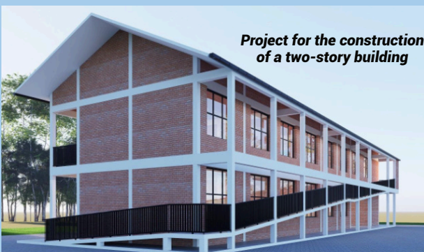
Project for the construction of a two-story building

Currently, the school has 1,162 students distributed across 28 classes, including 6 kindergarten classes. Enrollment remains limited due to insufficient classrooms. Families are particularly attracted by the school's discipline, the academic standards, and the positive atmosphere and relationships that prevail in our school. The school leadership is inspired and guided by Mennaisian spirituality and pedagogy. The District, committed to its long-term viability and stability, hopes that the Mennaisian mission will continue to grow and develop.