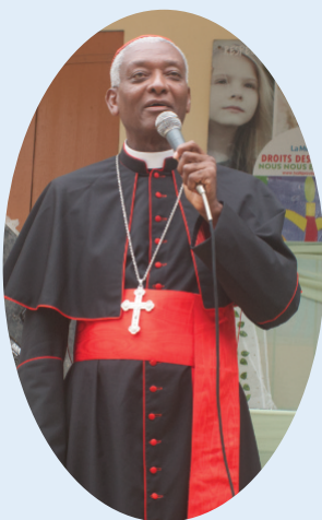
Cardinal Chibly Langlois