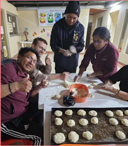
Volunteers and young people from the Mennaisian Family knead bread in Bolivia

Meanwhile, the young Mennaisians of Bolivia gathered at the Mennaisian Center for Encounters and Retreats in Achocalla. About twenty of them baked bread on Thursday, which they distributed on Friday to people in the street and at a youth center. This experience of service and solidarity deeply touched everyone. Saturday was devoted to artistic activities and deeper understanding of the Mennaisian charism. After the Easter Vigil, we shared a festive meal.