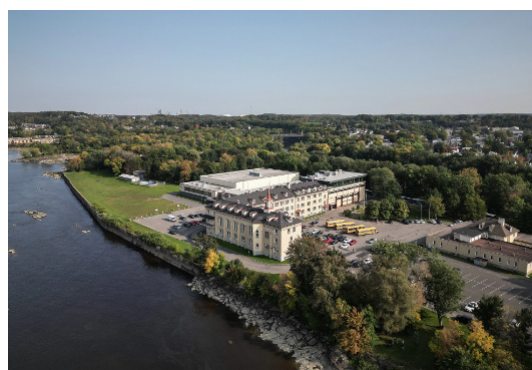
Juvénat Notre-Dame du Saint-Laurent - Saint Romuald

human resources, making it impossible to maintain direct management of these schools, the decision was made to entrust educational responsibility to the school boards and administrative teams. The objectives of this transition were threefold: had three main objectives: to ensure an orderly and sustainable process, to transfer well-maintained schools and facilities equipped for future development, and to guarantee the continued provision of quality educational services. Over a period of nine to ten years, the school boards gradually increased their payments as part of the process of acquiring the properties. In June 2025, Collège Jean de la Mennais officially became the property of its school board. The same process is expected to be concluded in 2026 for Juvénat Notre-Dame du Saint-Laurent.