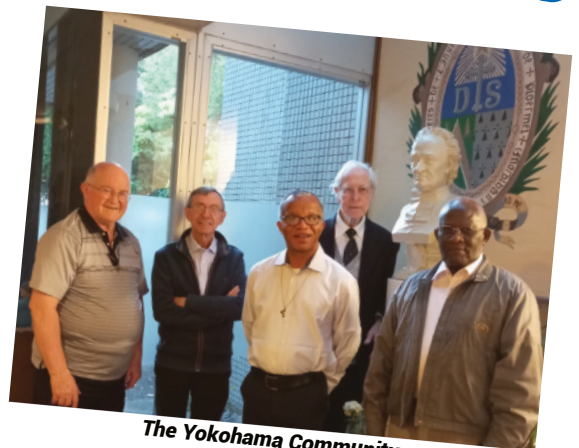
The Yokohama Community