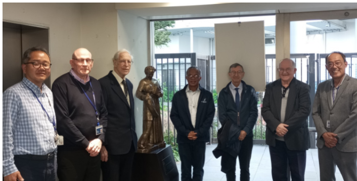
Tokyo International School - May 2026

Opened in 1954 for the children of foreigners residing in Tokyo. It also welcomes Japanese students but functions within the framework of an American high school.