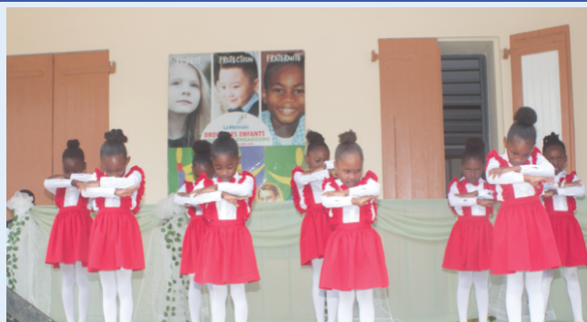
A theatrical performance by some students from the school

On Saturday, 16 May, after the celebration of the First Vespers, a large vigil gathered together around a campfire the delegations of Brothers, as well as the members of the Centenary committee, teachers and friends of the school.