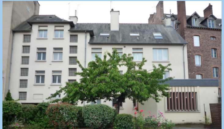
Interior view: parking and garden. To the right, the small chapel

The implementation of this important decision involves several aspects (sale of the Casa Generalizia in Rome, preparation of the house in Rennes, and the move). It therefore requires time, which will necessitate a residency of a few months in Ploërmel for the Brothers currently living in Rome who are destined for the Rennes community. The final destination for the Archives in Rome will be the Mother House in Ploërmel.