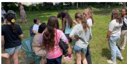
Students in the gardens of the Mother House

Throughout the year, the 1st year students of each of our secondary schools, spend a day at the Mother House to discover the Founders and the Institute. Thus, on 29th May 2026, 200 1st year students from the Sacred Heart College of Lamballe visited the Mother House in Ploërmel. It was a day full of joy and Mennaisian spirit for everyone.