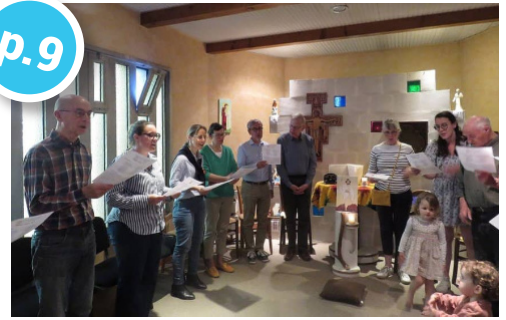
Echoing our year's theme