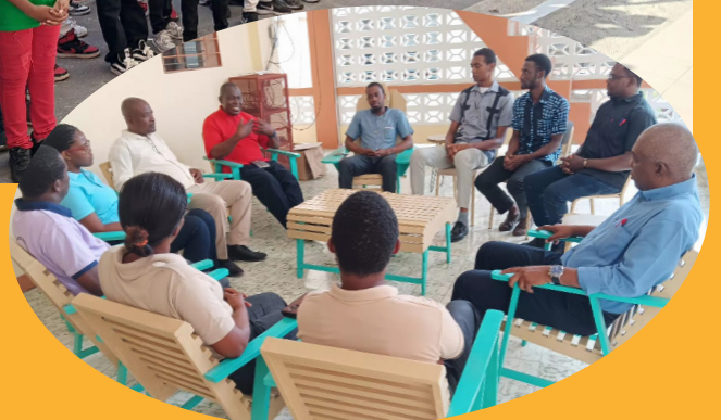
Meeting of the local Mennaisian Fraternity with the General Assistant Brother