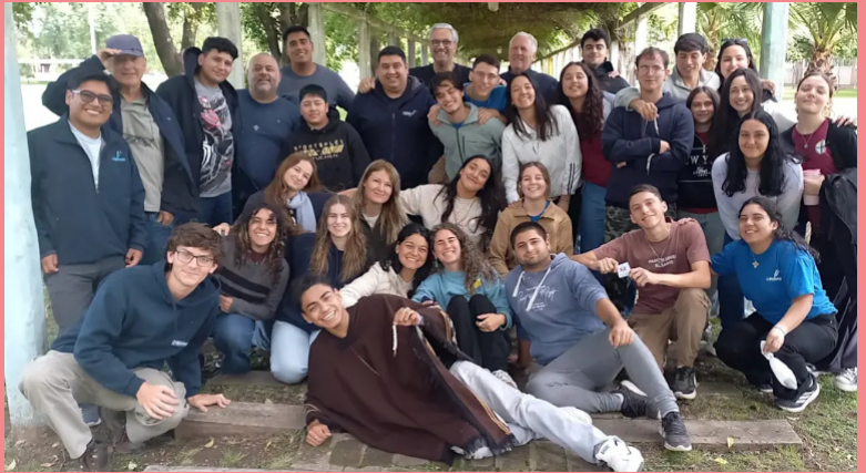
Young people and brothers participating in the meeting in Argentina

At the Teodelina School in Villa Gobernador Gálvez, Argentina, young people from Chile, Uruguay, and Argentina gathered from Friday, April 2, to Sunday, April 4, to celebrate the Paschal Mystery together. They enjoyed the magnificent liturgical celebrations to meet, to connect with one another, and to encourage each other in following Jesus according to the Mennaisian charism.