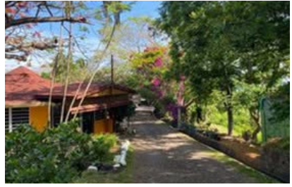
The area surrounding the Foyer des îles