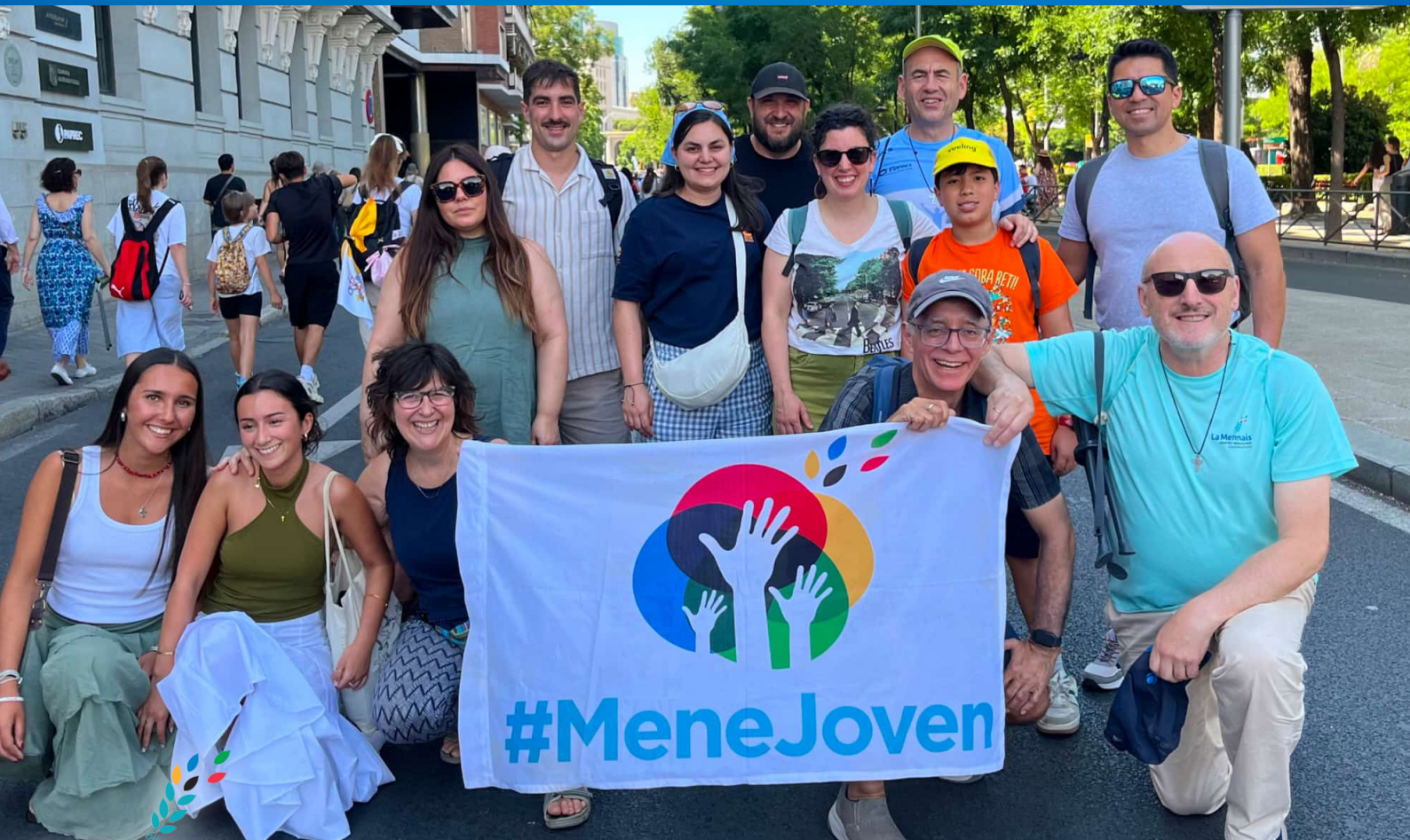
Brothers and young Mennaisians with Pope Leo XIV in Madrid - June 7, 2026