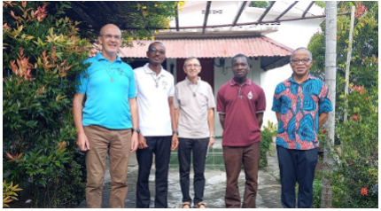
The 3 Brothers from Timor and the Two Visitors

This visit, the first since our arrival in January 2025, was very important for us as it was a moment of true discernment regarding the future of our new mission in Timor. After a period of adjustment and language learning, we have already committed ourselves to the mission among young people. The question now is where and how to continue developing a Mennaisian educational presence and to encourage a vocational growth among young Timorese.