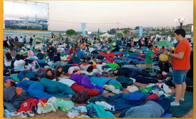
Sunrise with the Spanish team.