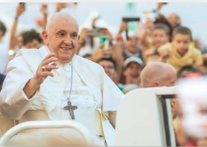
Pope Francis: «We only possess life by giving it away!»