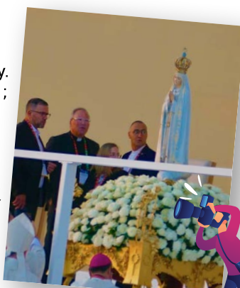
Here, a statue of Our Lady of Fatima, which the Pope visited during World Youth Day.

Mary cultivates joy along the way. She tells us to grow and keep smiling ; we must learn the art of walking.