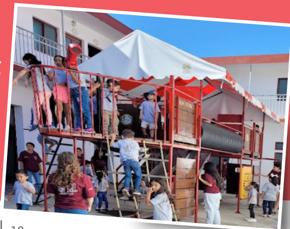
The Vikings' theme impressed the children of Noah's ark in Huatusco.

https://www.facebook.com/MenesianosHuatusco