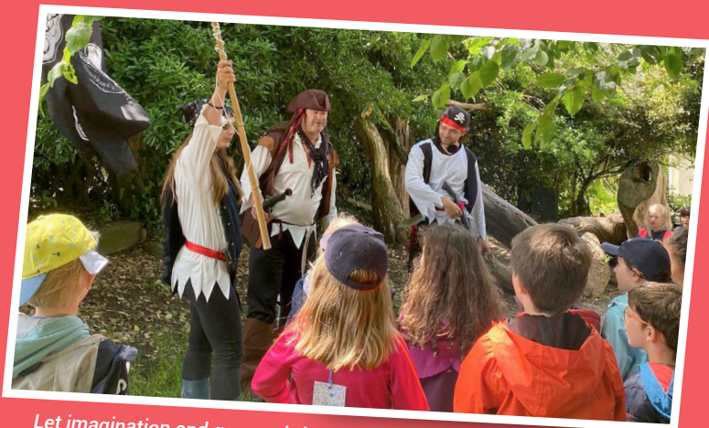
Let imagination and games thrive at the Palandrin with Estival, France.