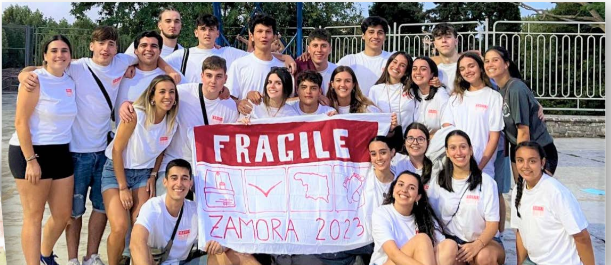
Many summer camps were organized this past summer throughout the Province of Spain. Here in Zamora.