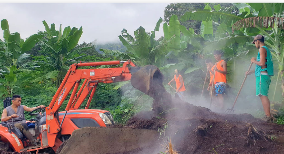
The students of 1st Bac Pro CGEA turn over the compost pile to ventilate it. After about three months, it will be used as fertilizer and organic compost for our crops.