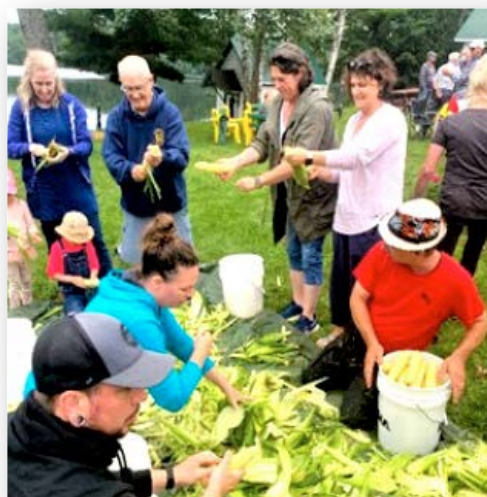
A family celebration in a setting of natural beauty at Lake Paterson.