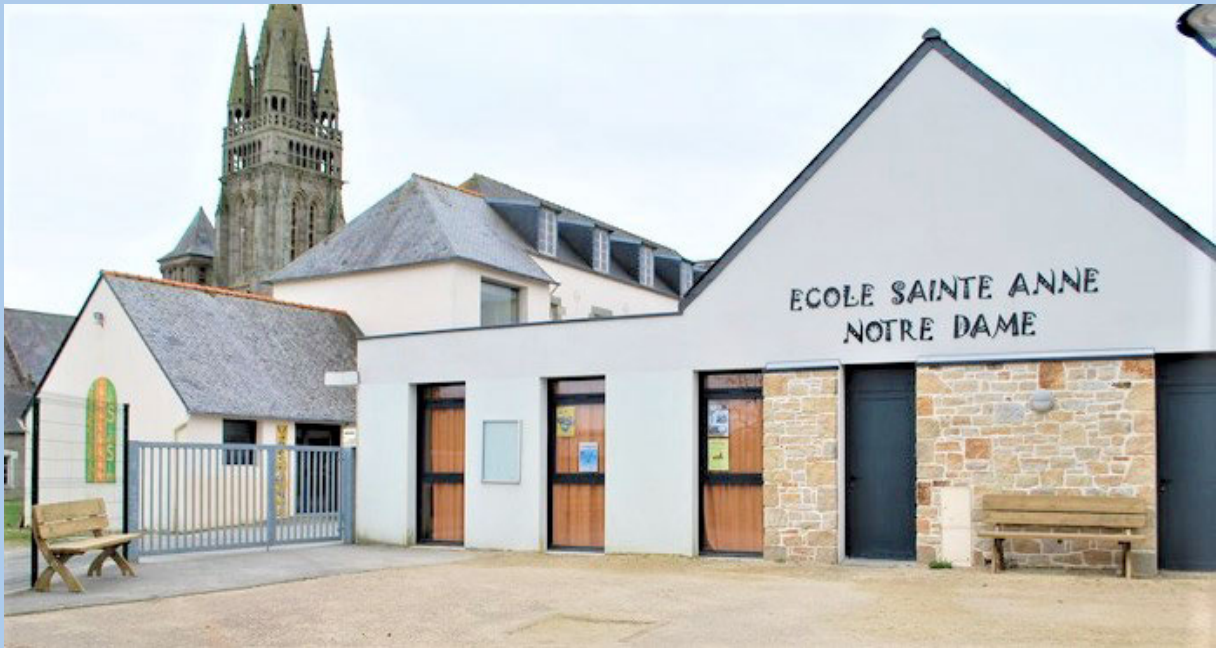
The Sainte Anne and Notre-Dame schools in Folgoët are now grouped on a single site.

Two recent projects have just been initiated. In Folgoët, Finistère, the Sainte Anne and Notre-Dame schools two sites have been regrouped. A loan from 'MNEG' to the amount of 50,000 € was granted.