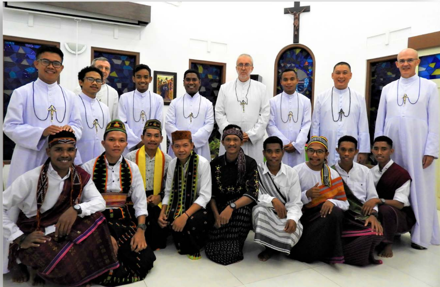
In Yogyakarta, the community is well animated with many young people in formation.

There are no novices this year, as we are moving to a 2-year postulate. The 2nd year postulancy and novitiate will normally be in San José , Antique, in the Philippines. In the Philippines, news of a potential applicant is awaited.