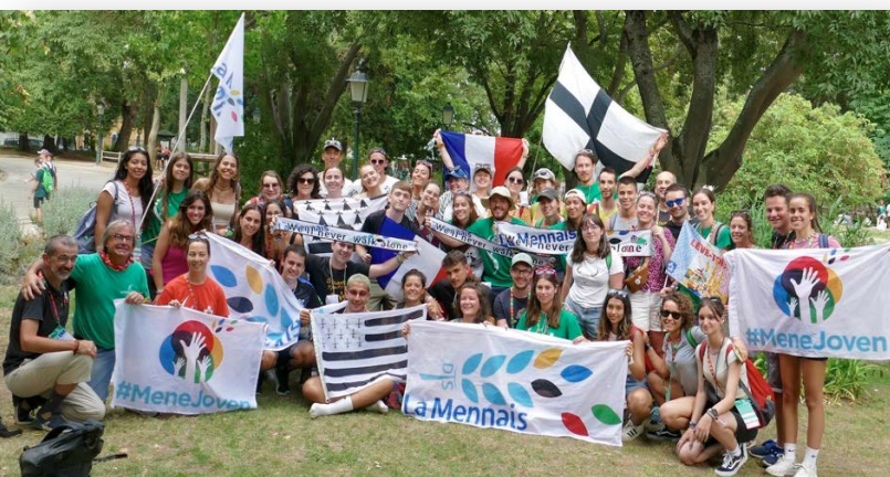
The French and Spanish teams from the La Mennais delegations.

«We keep the memories developed in our hearts. We are touched by the fact that Pope Francis speaks to every young person.» On August 6, he announced to the world that the next WYD, in 2027, will take place in Seoul, South Korea. He is also inviting young people to Rome in 2025 for the Holy Year Jubilee on the theme of hope. Let's get moving!