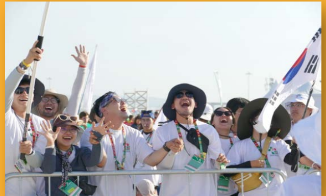
Pope Francis announces that the next WYD will take place in ...