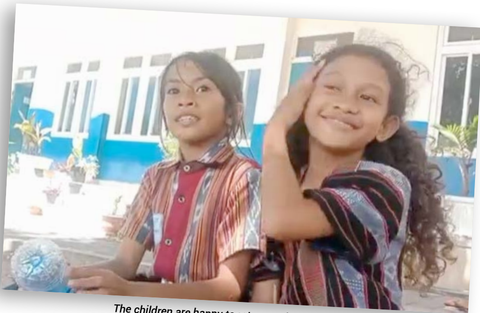
The children are happy to return to the SDK school in Larantuka, Indonesia.