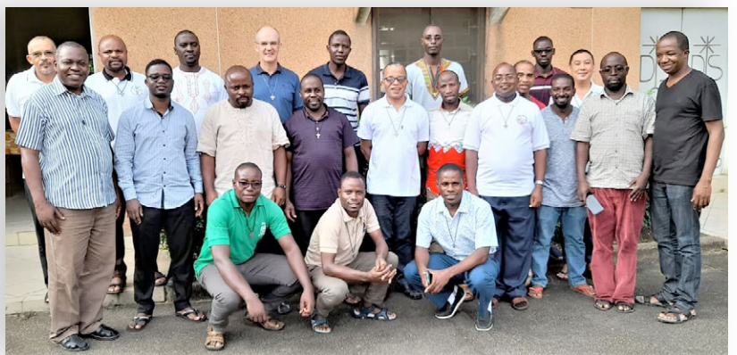
There was no shortage of topics for the Brother Formators!

https://www.lamennais.org/en/laboratory-16-brother-formators-completed-two-years-of-an-unprecedented-journey-in-abidjan/