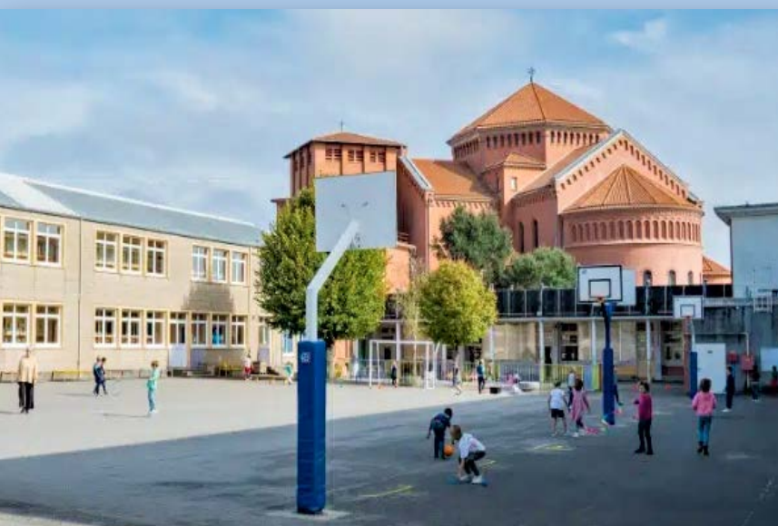
An appeal has been made to help finance the projects of the Sainte-Agnès school and the Saint-Théophane-Vénard College, in Nantes.

At the Sainte-Agnès School and the Saint-Théophane-Vénard College in Nantes , accessibility and fire safety equipment are essential. A loan of 125,000 € is requested from the 'MNEG' but is not possible for the moment given the unavailability of the cash flow of the fund.