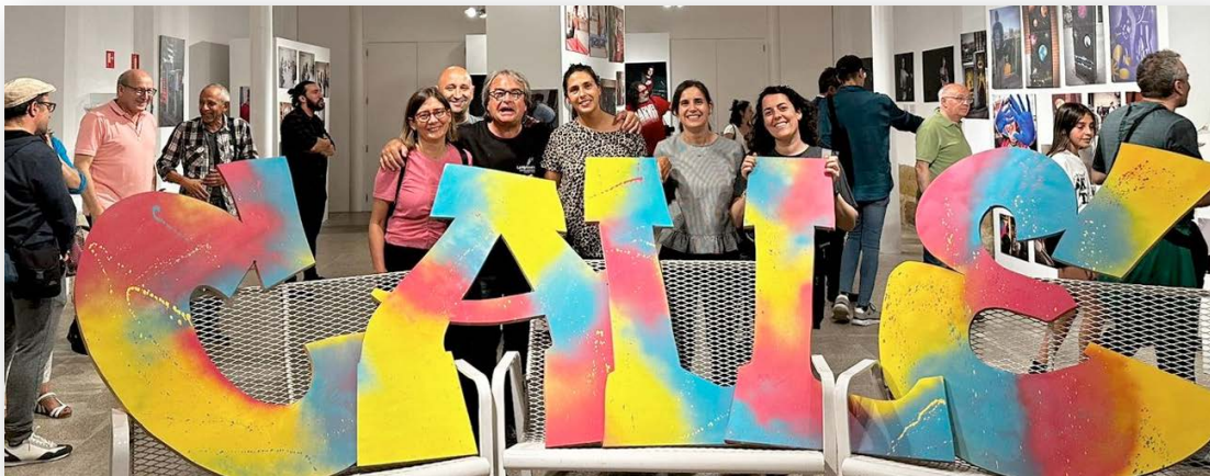
Part of the team of educators from the Joven Mennais Center in Zamora in front of the exhibition on street education.