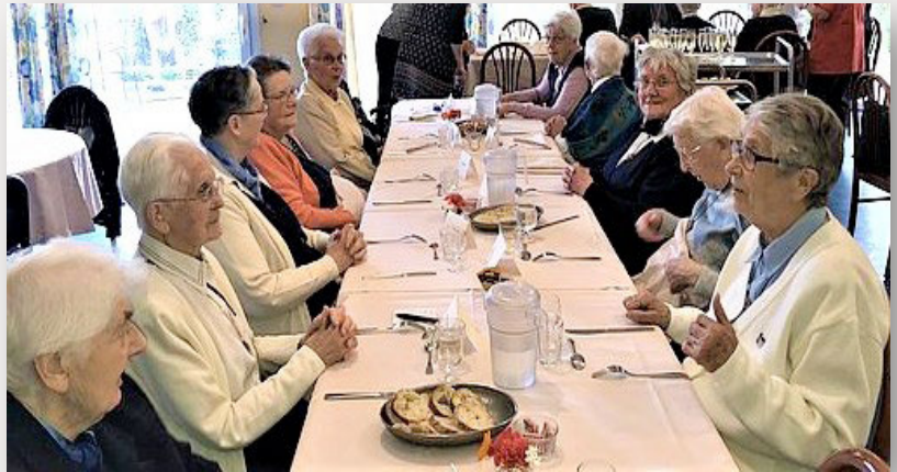
Several Sisters of Providence during a meal taken several years ago. To the St. Joseph hermitage in Cesson is now added some equipment for a temporary reception.

On January 1, 2009, the Congregation of the Daughters of Providence ceded the EHPAD (Saint Joseph Hermitage) to the Montbareil Association. Today as yesterday, the Saint-Joseph Hermitage offers lay residents and nuns a place of medical life adapted to their needs, in the heart of the small village of Cesson.