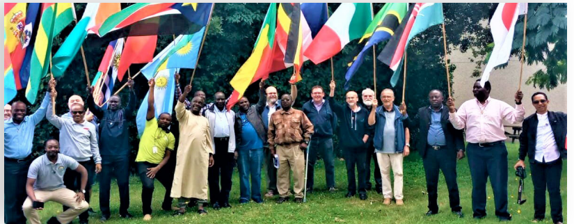
4 weeks of fraternal life for the participants during the brief stay at the Lycée La Touche in Ploërmel.

https://www.lamennais.org/en/23-brothers-in-session-at-la-touche-ploermel/ https://www.lamennais.org/en/end-of-session-for-23-brothers-in-ploermel/