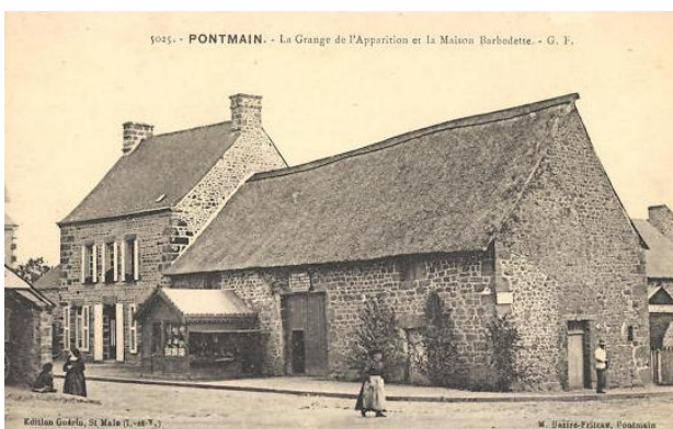
Pontmain, the Apparition Barn and the Barbedette House