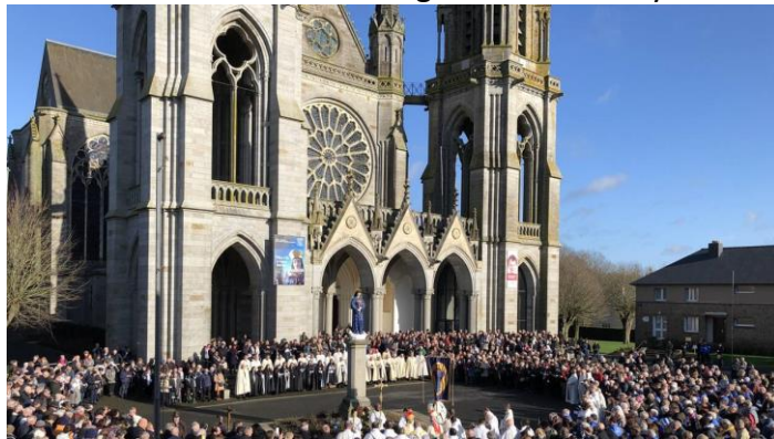
Pontmain. Around the Virgin, an intact fervour