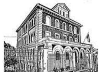
Sant Ivo School - Rome