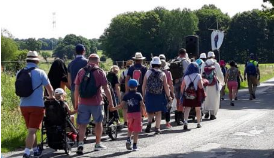
Pilgrims to Pontmain

Recourse to the Holy Virgin, to ask her to Renew her Protection over the Nation and over the Whole World, in the face of that Immense Tragedy, which was destroying Humanity.