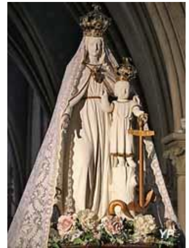
Our Lady of Hope in St Brieuc