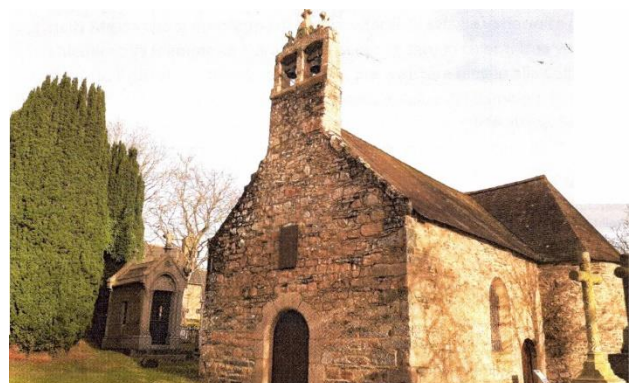
Chapel of Lanvignec