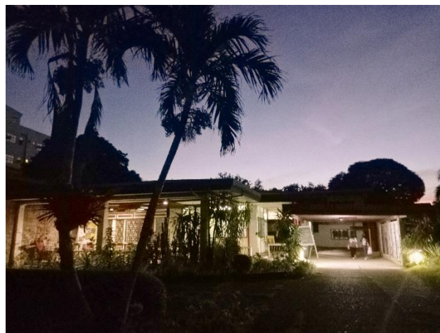
Postulancy-Novitiate Community in San José

Currently, the Brothers in the Philippines are going through a difficult time difficult. The Scholasticate was transferred to Yogyakarta in 2023, and the Pandan Community, the only one