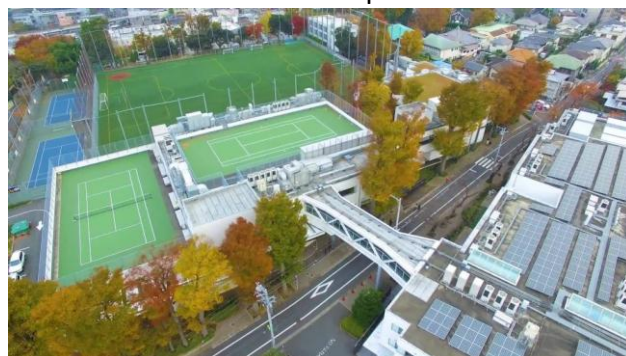
St Mary's Tokyo

They responded to a Pressing Invitation from the Holy See and the need to help rebuild a Country that had been completely destroyed both Materially and Morally. The Province committed to sending Three Brothers per year for the First 15 Years. In 1971, 44 Brothers were placed there: a Huge Donation made by the Canadian Province, especially since the Brothers sent had to be particularly well-prepared in the Language, Academic Studies, and the Evangelical Approach of a people with a Very High Degree of Organization. The Mennaisian Work developed around Three Institutions: St. Mary's International School in Tokyo, for the Christians of the Capital; the large School, from Kindergarten to Secondary School, of Seiko Gakuin (The Holy Light) in Yokohama? A Secondary School in a more Modest Environment in Shizuoka. Special attention was