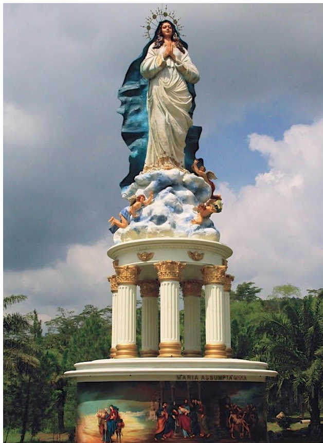
Ambarawa - Indonesia

Still in Indonesia, but on the Island of Java , in Ambarawa , the Virgin Mary has long been venerated in her Gua Maria, especially by