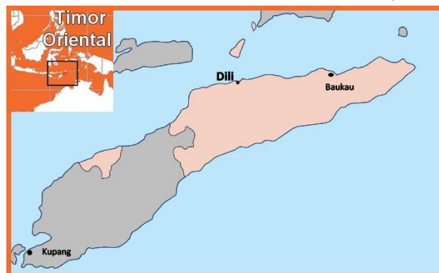
East Timor (Leste) capital Dili.

The Latest of the Brothers' Missions, the