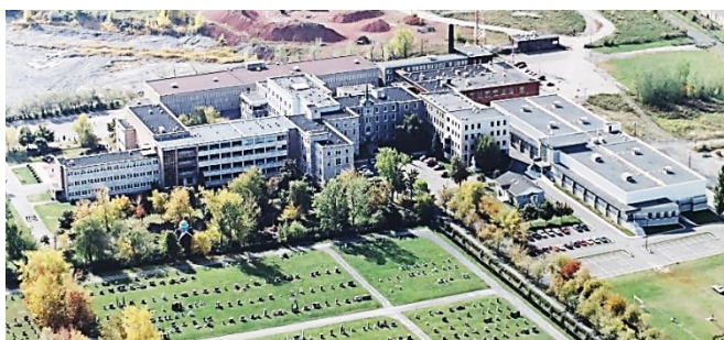
Mother House of La Prairie

However, the years of the "Quiet Revolution" arrived. A Profound Crisis shook Western Societies and shook the Church. The Brothers were forced to abandon their Schools to enroll in Enormous, Anonymous "Multi-Purpose" Schools. A large number deserted the Congregation, which became smaller and more fragile. Despite the Crisis, the Canadian Brothers relaunched their Missionary efforts: in 1968-9 they opened the Difficult Missions of Rwanda-Burundi, Congo DRC, and in 1987, the Philippines. In Canada, the Brothers' numbers declined rapidly, but the Work of the Schools was resumed, in