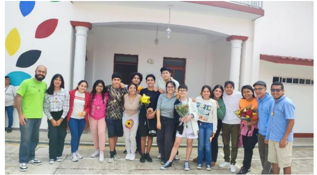
Brothers, Laity and Youth at the John Paul II Center

"In 2017, the Jean de la Mennais Province took complete control of the Work, and the Community decided to plant its roots in Mexican Soil by risking a Vibrant Vocational Ministry and accompanying young people on a Personal Journey. The Mennaisian Family played a Major Role in that New Presence." The Community received support from other Provinces (Haiti, France,