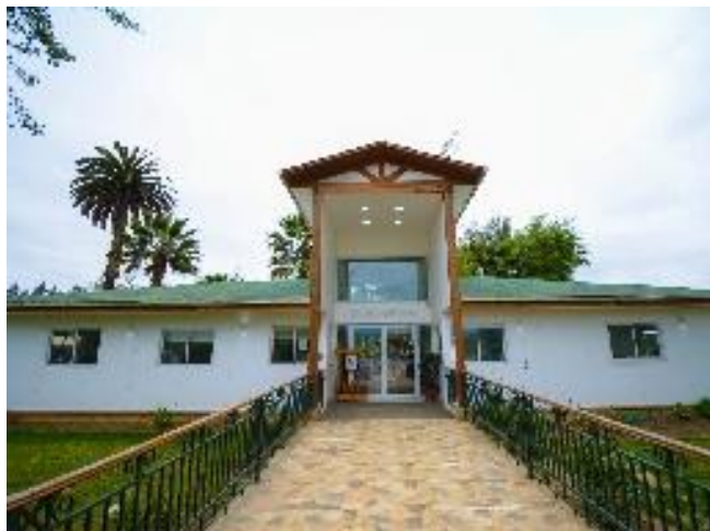
Centro Menesiano de Culipran, Chile

following year the school was destroyed by a violent earthquake. A new building was built to welcome young people from the surrounding countryside, providing them with suitable education, especially in the field of agriculture.