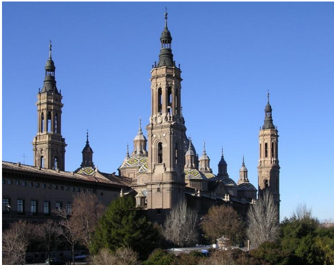
Basilica of Nuestra Señora del Pilar

The people of Zaragoza took charge of the sanctuary of the Virgin, which guarded the Pillar given by the Holy Mother of God. This was already venerated by the apostles and the first Christian communities, as the Mother who points to her son