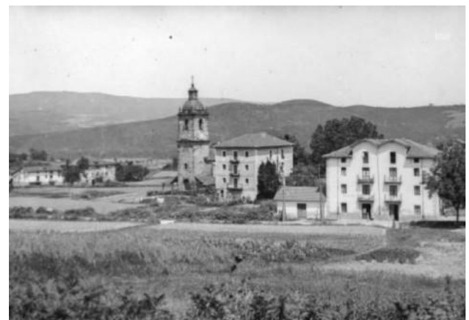
1904 El Camino

close to Spanish territory, who asked to emigrate to this new country. The Sainte-Marie Province was very prosperous at the time: it had about thirty communities, was established in important cities (Bordeaux, Biarritz, Lavacan, Montpellier, Perpignan...), it had a great presence in Lourdes in the animation of pilgrimages... For the most part the Brothers opted to pursue their vocation in the world, in particular in Spain. The emigrant Brothers settled in makeshift houses, near the border, in