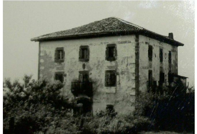
1903 in Zugarramurdi

government drove the Brothers out of their schools and banned their teaching. The Superiors sent some representatives of the Institute to prepare the reception of the Brothers who were determined to continue their Mennaisian mission in Spain. It was mainly the Brothers of the Sainte-Marie du Midi Province, in the southwest of France, quite