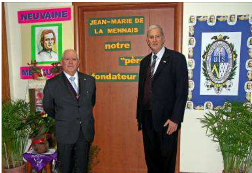
On the occasion of the "Day of our Founder », in Rome