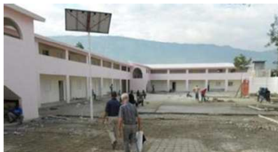
College de Jacmel en construction

At Delmas, the reconstruction of the Primary school is well advanced. Very soon it will be the turn of the Secondary School.