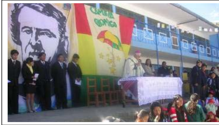
Sainte Messe célébrée par Mgr l'Evêque, lors de la Fête de Jean Marie, sur la cour de l'école

The transversal axis of the Novena was the motto of the Province for this year: "Attentive ears and available hands" . In line with this motto, three campaigns were realised: imperishable foodstuffs, scholastic materials and clothes; they were destined for the needy people in our area, to the parish Caritas and to the "Triangle district".